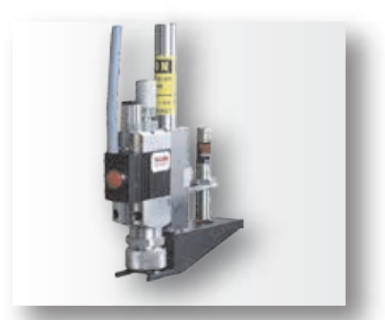
Multi-Orifice Non-Contact Version